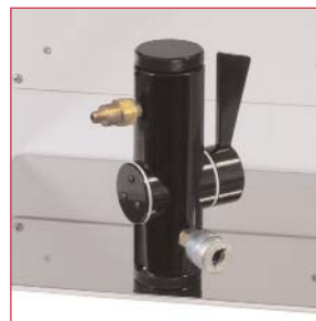
Polymer Chip Transfer Vessel