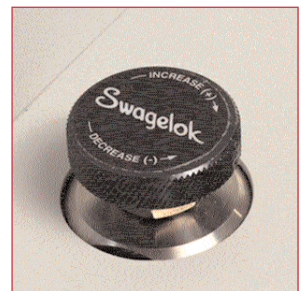
Nitrogen Regulation Valve (fitted as standard)