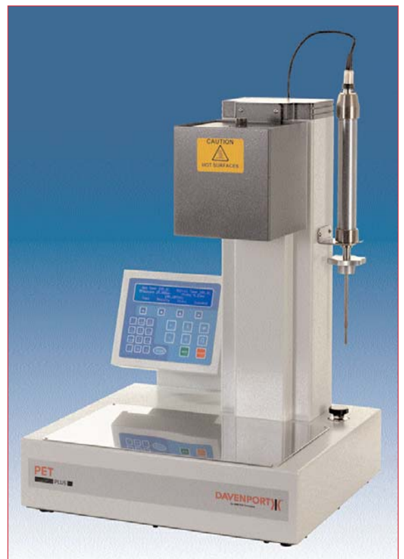
PET Plus - Unique test instrument for the Intrinsic Viscosity Measurement of PET .