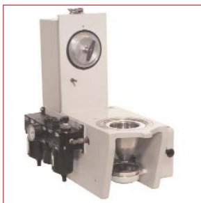
Quick Test Polymer Chip Grinder